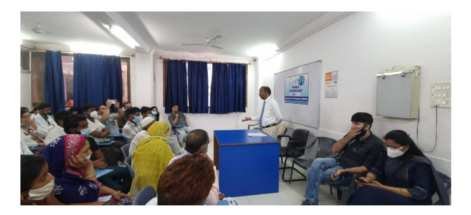
Public Awareness Programme on World Asthma Day