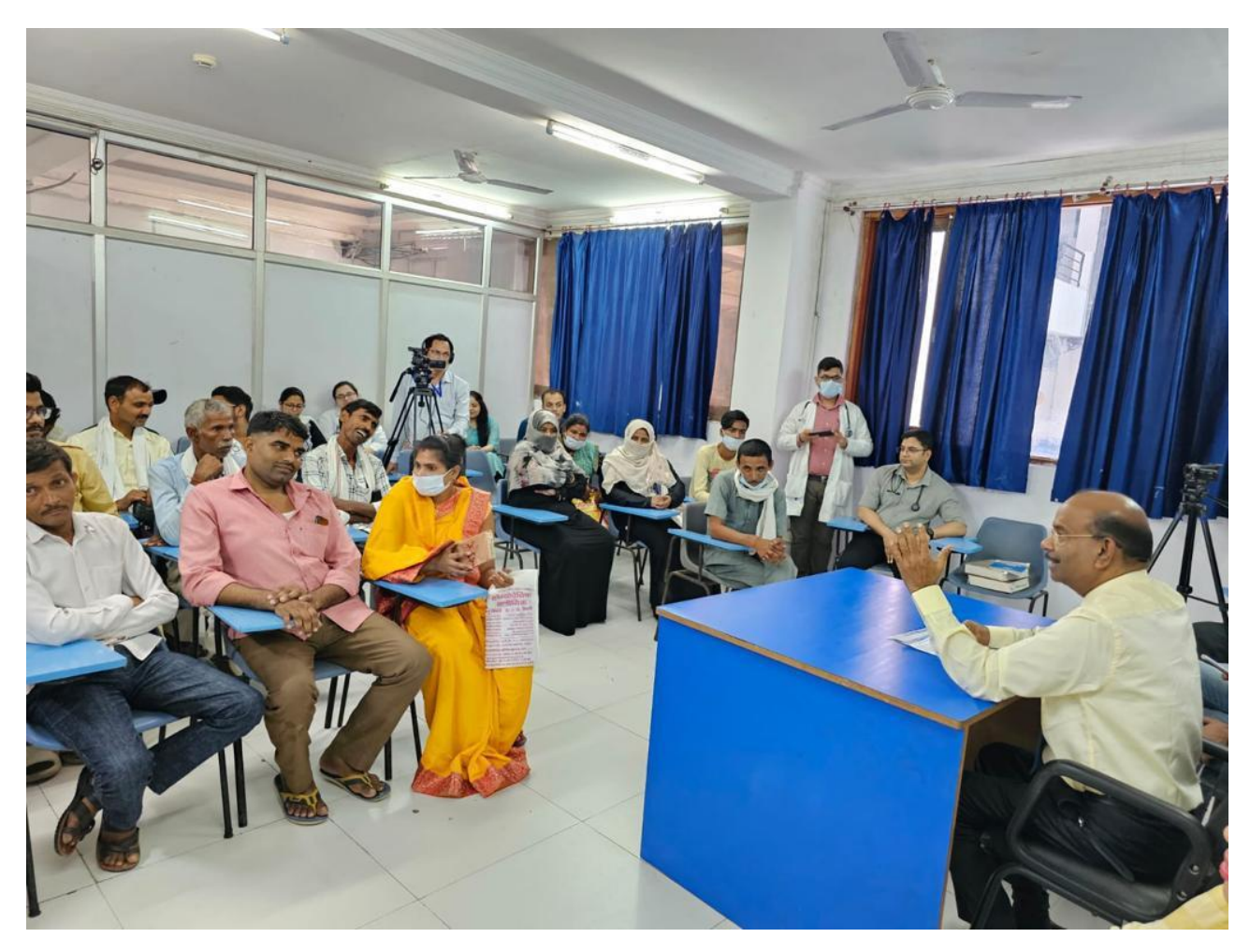
Public Awareness Programme on World NO Tobacco Day