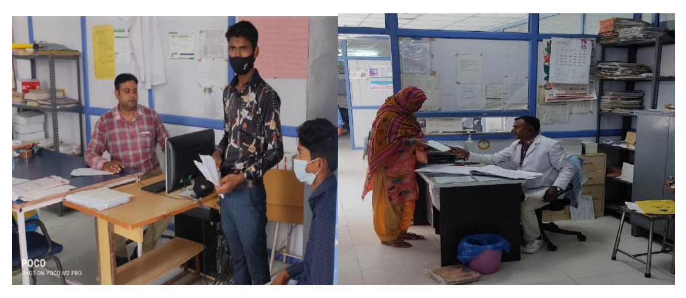
NTEP Activities (DOTs cum DMC center, DRTB Treatment Facilities)